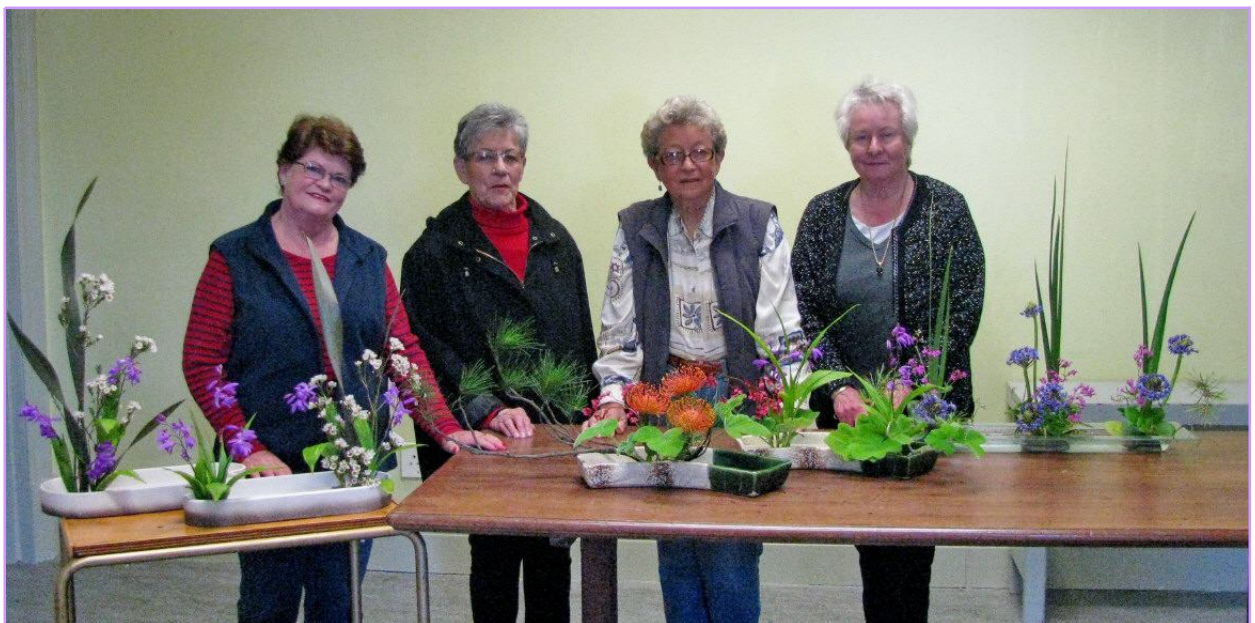
A class at the Athenaeum on 12 th September 2013