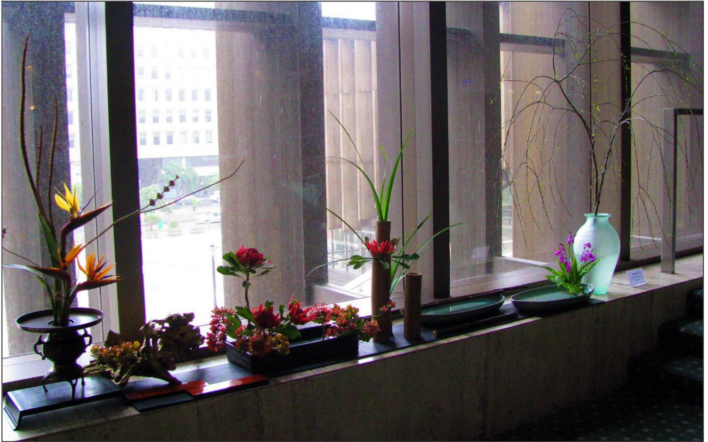
A display at the Artscape theatre complex on 19 th October 2013.