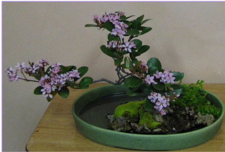
Spring landscape arrangement